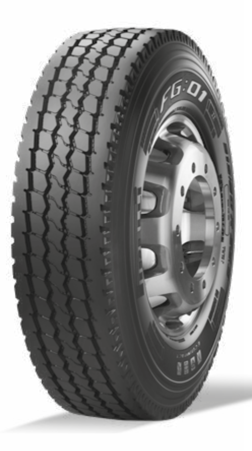
PICTURE: 315/80 TREAD PATTERN. 13 AND 295/80 TREAD PATTERNS: 3 GROOVES

Designed for steer and all around fitment of vehicles used in construction site, features high resistance to laceration and grip in off-road and mileage on asphalt road.